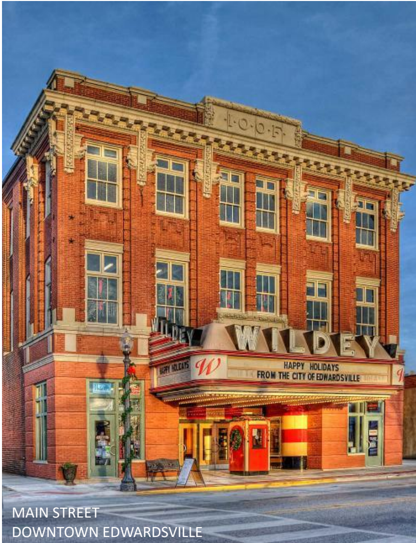
MAIN STREET DOWNTOWN EDWARDSVILLE

The City of Edwardsville, Illinois, is a thriving community east of St. Louis offering high quality development opportunities, outstanding demographics, progressive city planning, and visionary municipal leadership.